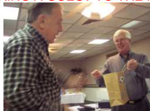
Oh, here it is!!